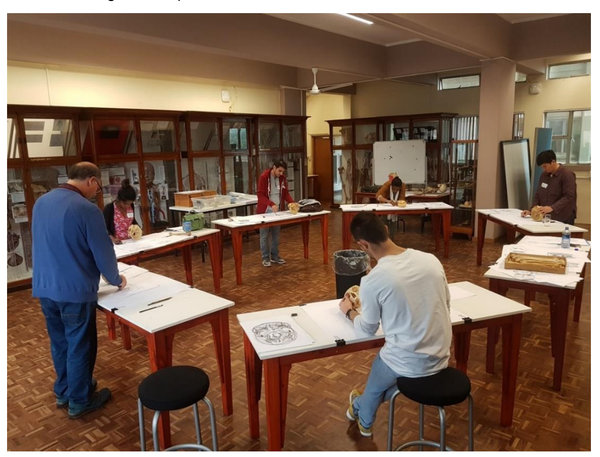
Before Covid-19: Health care professionals attending an Anatomy Observation and Drawing workshop at the University of Cape Town, South Africa, 2019.

There is no charge to you for this workshop and is a part of your Anatomical Society Winter Meeting 2020 experience.