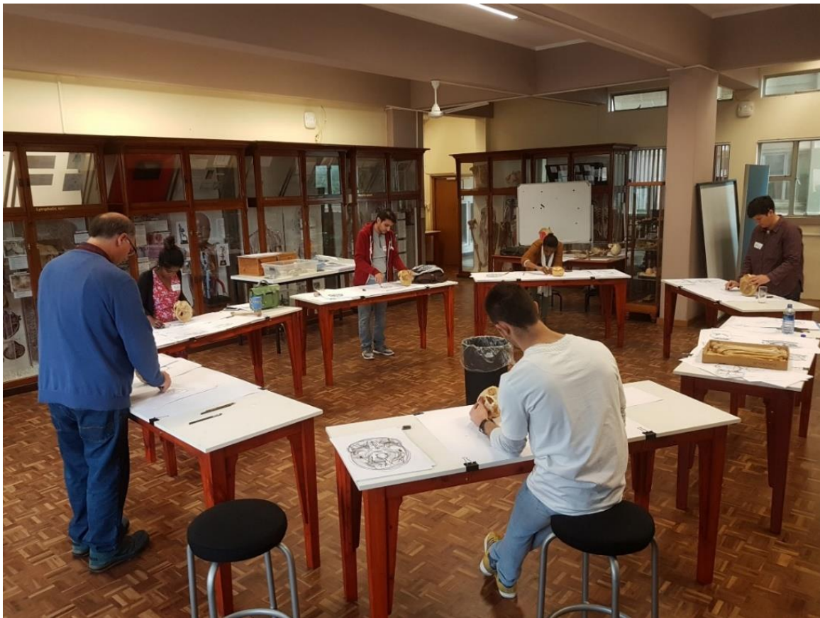
Before Covid-19: Health care professionals attending an Anatomy Observation and Drawing workshop at the University of Cape Town, South Africa, 2019.

There is no charge to you for this workshop and is a part of your Anatomical Society Winter Meeting 2020 experience.